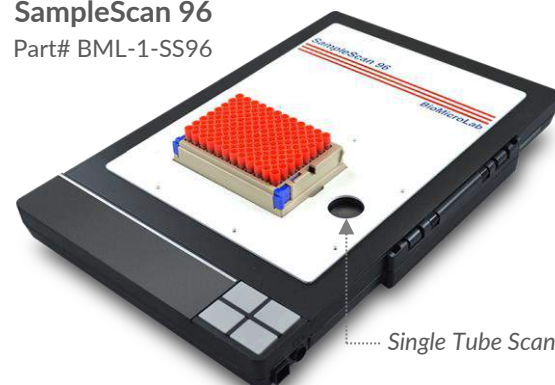
SampleScan 96 Automated

Includes MS-2 Reader to capture the rack ID Part# BML-1-SS96-1D